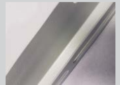
Process Four Epoxy polyester powder coating