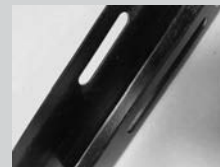
Process Three ED coating process: electrophoretic deposition (aka ED or EPD) coating